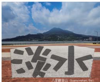
八里觀音山 Guanyinshan, Bai