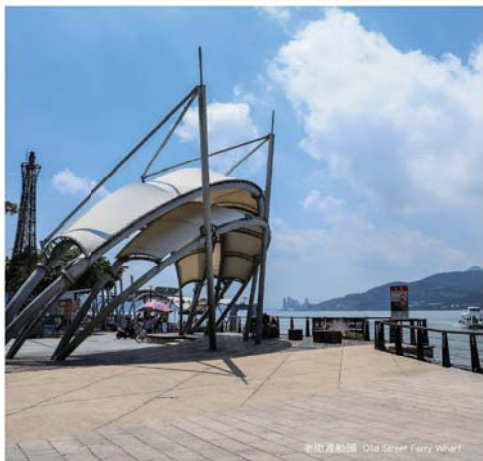
老街渡輪碼頭 Old Street Ferry Wharf